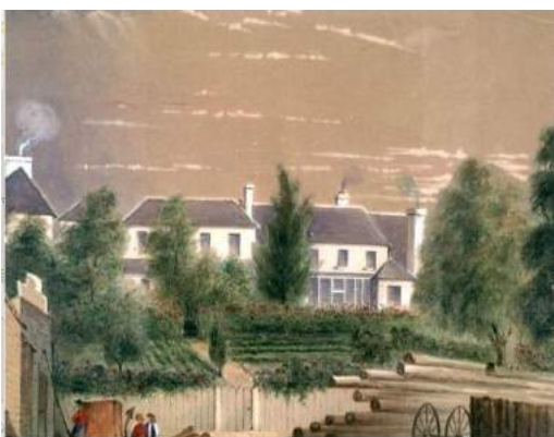
Site of old Government House, where Lieut. Governor Sorell resided in 1819. Elizabeth Street, near Franklin Square, Hobart TAS 7000 Ann & Thomas, together with Ann's brother Joseph Withers, arrived in Hobart on 11 Oct 1819. They had originally intended to continue on to Sydney, but Ann was pregnant and unwell, so they applied for permission to settle in Tasmania. Governor Sorell issued a temporary landing permit, and they were soon granted full permission to emigrate.